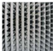
Aluminum Separator Pack

All materials used in the construction of our HEPA and ULPA filters are of the highest quality and durability. Based on your needs, we can build with stainless or galvanized steel, anodized aluminum, polymer based frames, plywood and particle board. Our filters are built to last!