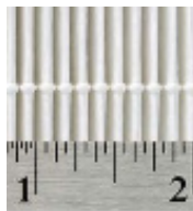
Mini Pleat Pack

We provide the optimum pleat pack configuration to meet the application performance requirement.